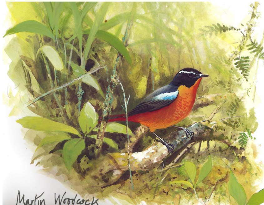
Blue-shouldered Robin Chat