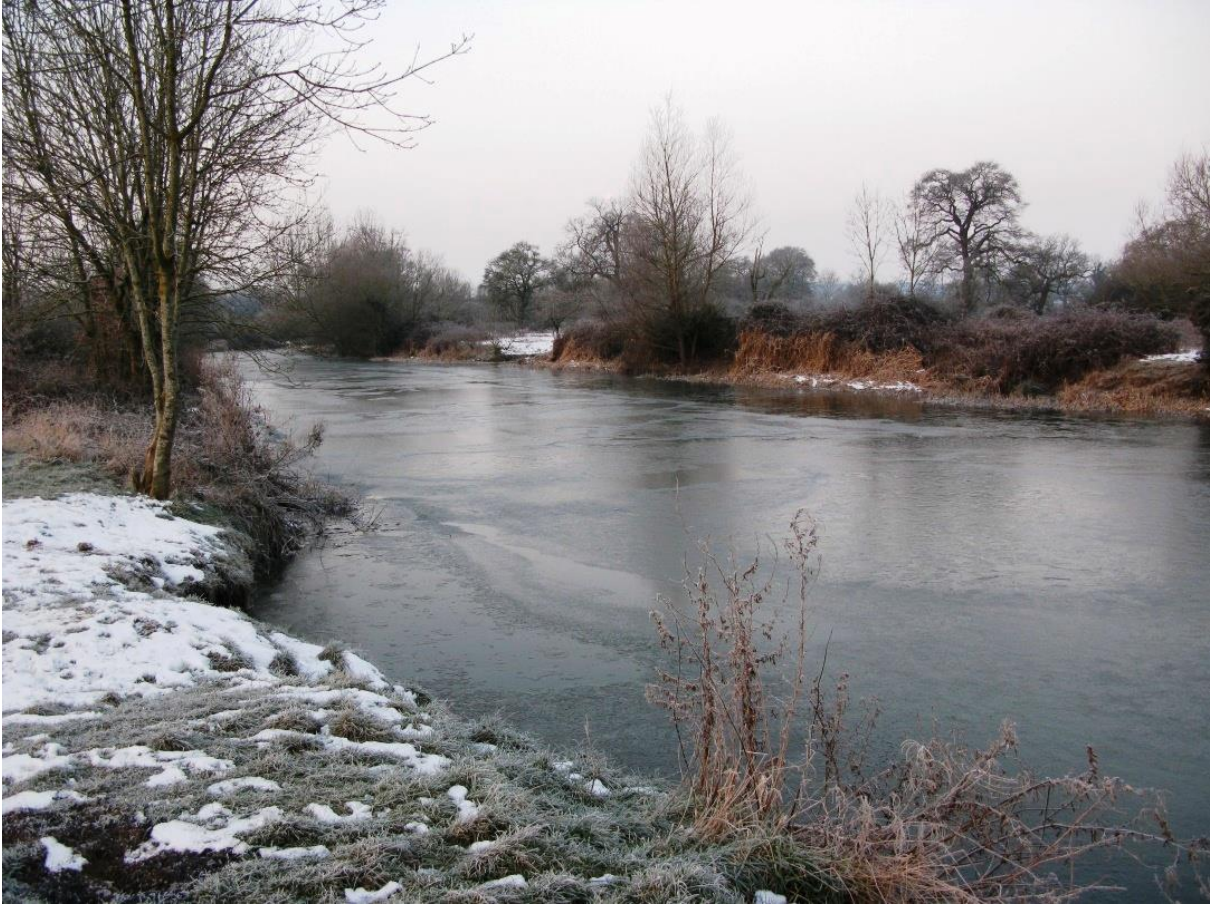
River Medway at Haysden

Kingfishers can be seen anywhere - maybe zipping through The Shallows, but Barden Lake, Haysden Lake and Longfield Lake (just to the west of Haysden Lake) are all good for this species which can also be seen fishing along the River Medway. As with most birds, the longer you are on site, the greater the chance you have of seeing what you are after!